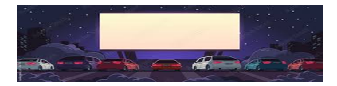
Sponsored by the Chardon After Prom Committee

Chardon After Prom proudly presents the 2nd Annual Juniors Movie Night Out!