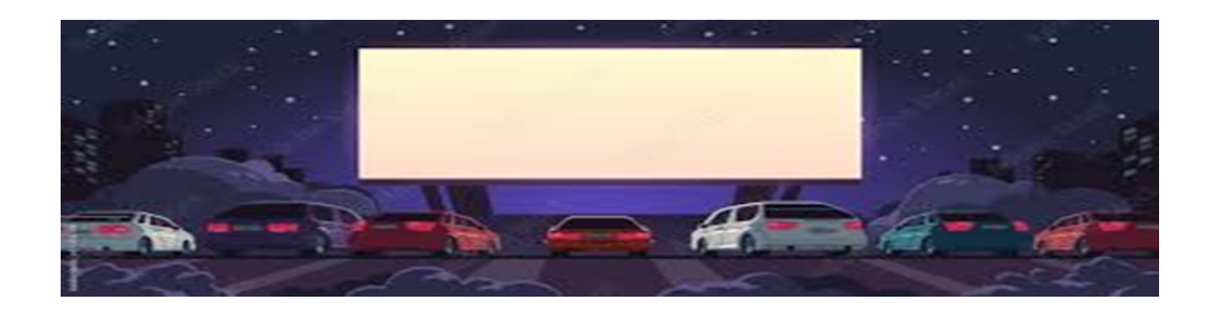
Sponsored by the Chardon After Prom Committee

Chardon After Prom proudly presents the 2nd Annual Juniors Movie Night Out!